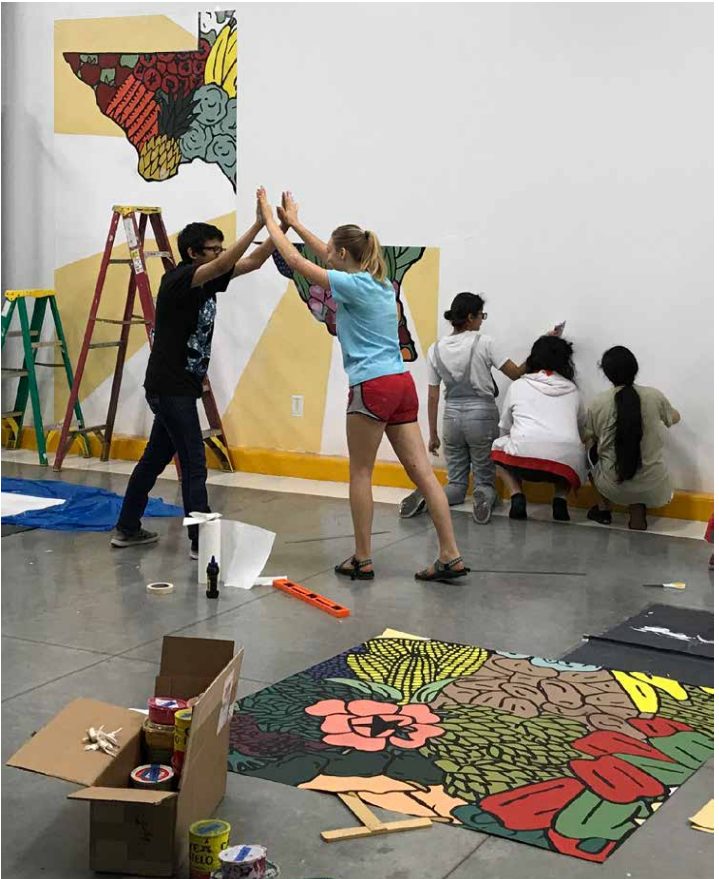
Color Squad was commissioned to install an educational mural at the Central Texas Food Bank, which commemorated the 10 year anniversary of the UT Austin School of Public Health.