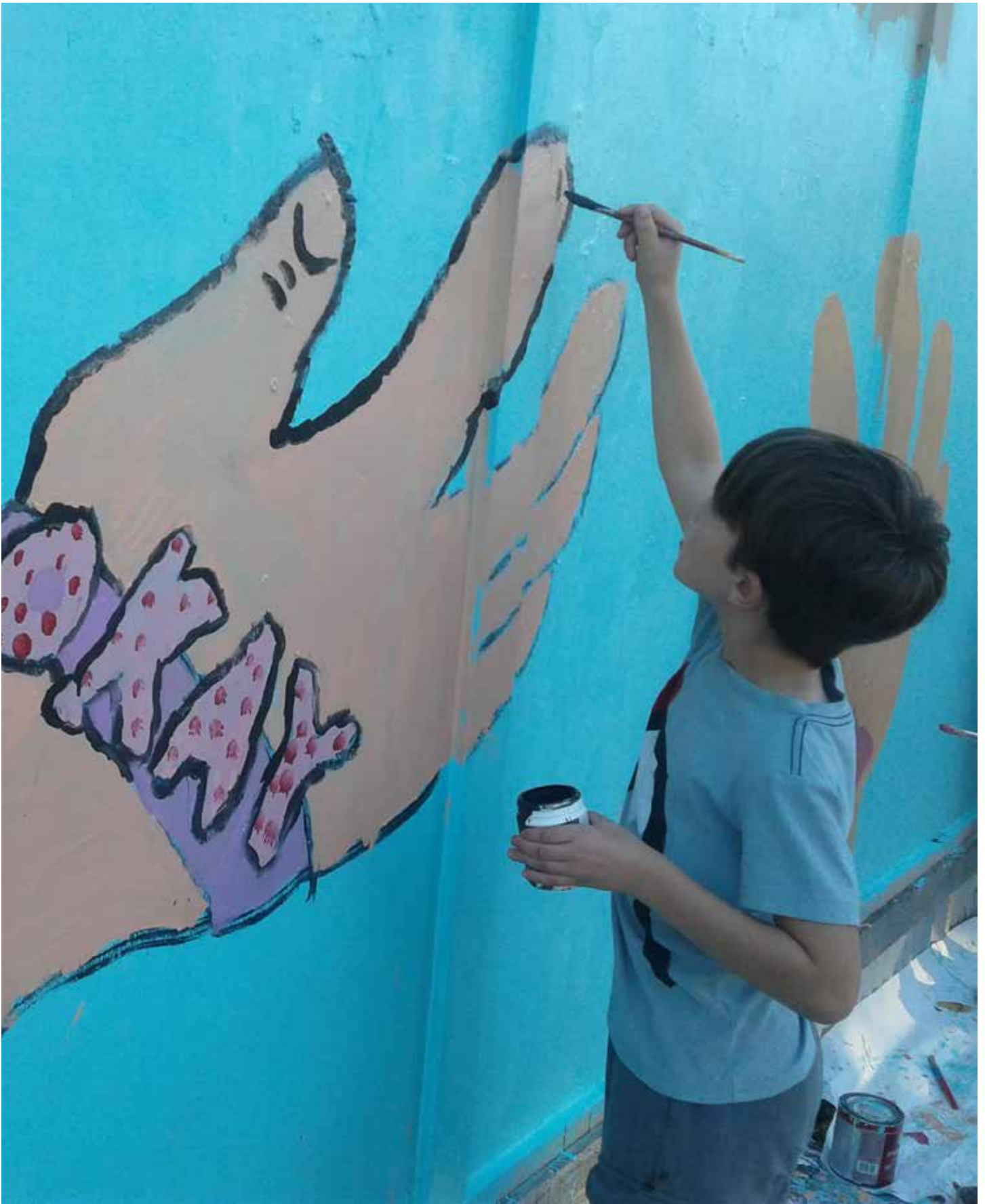
Students in the Creative Action After School at Brentwood Elementary painted a mural as part of their final sharing in Fall 2017.