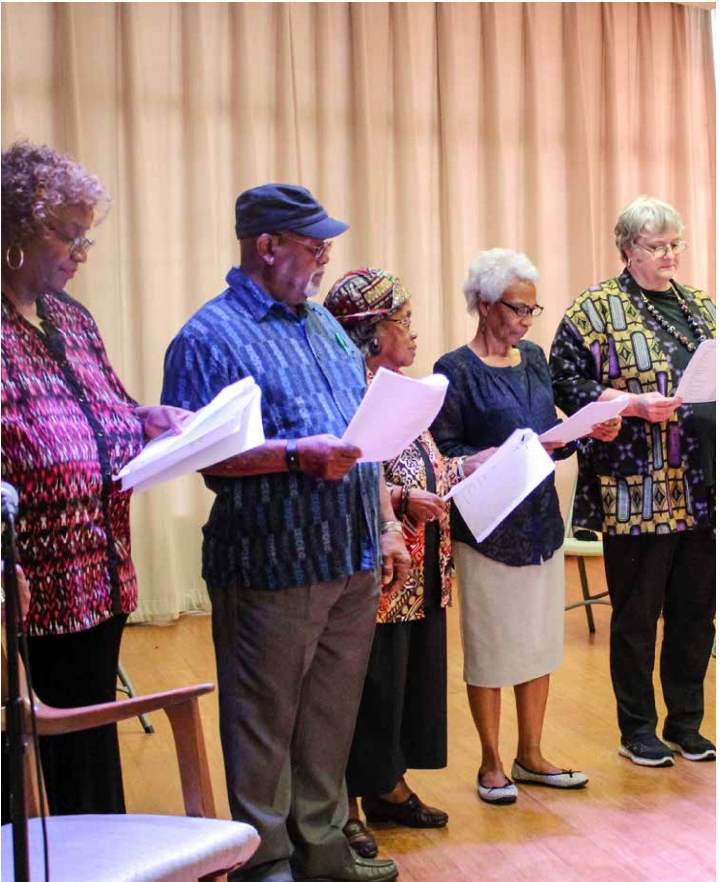
Members of Creative Action's Continuing Creativity program, a group of older adults focused on using art to increase vitality and cognitive health.