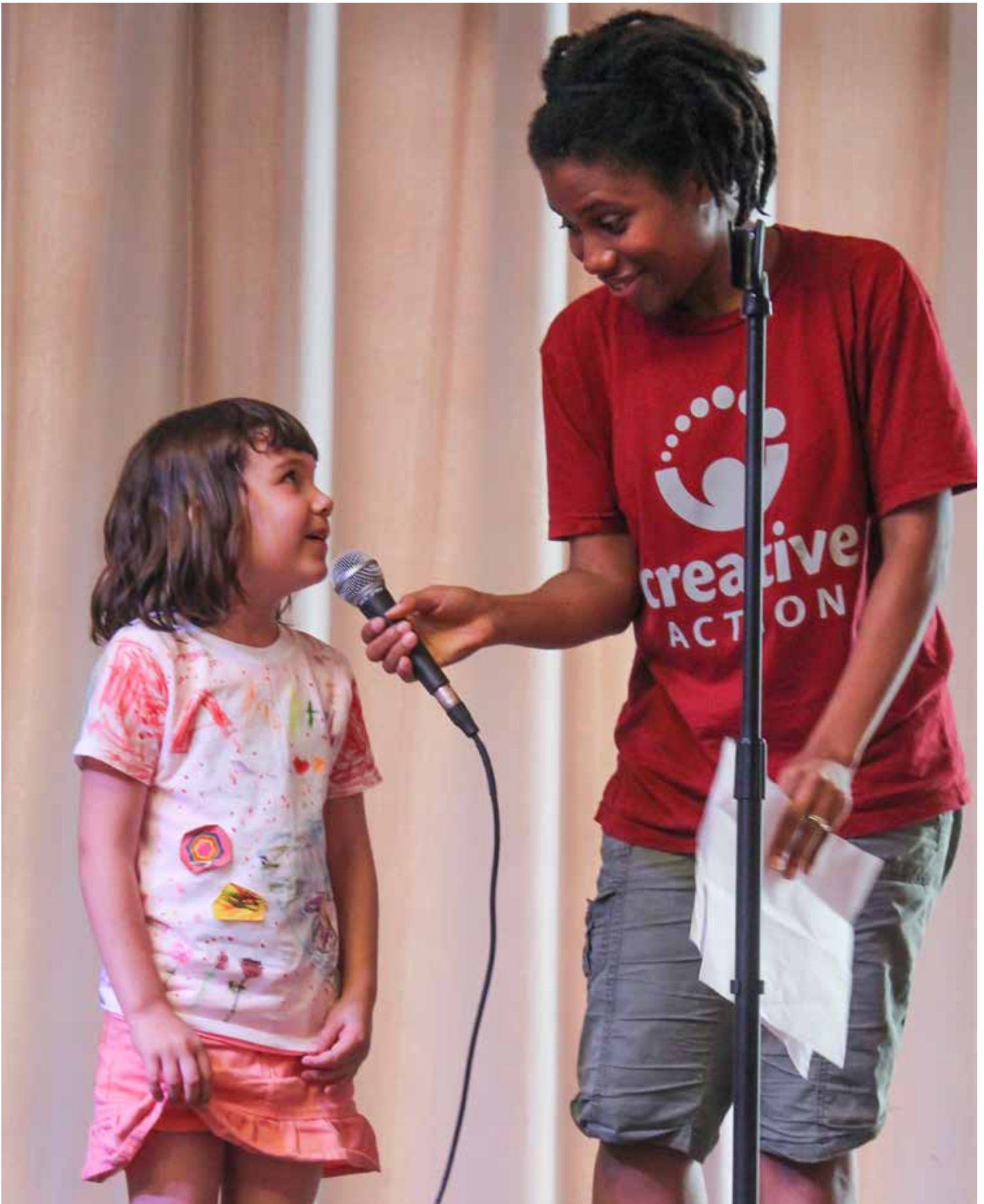
At the end of each Creative Action camp, participating youth host a “final sharing” for friends and family where they present their artistic projects and skills they’ve developed during the program.