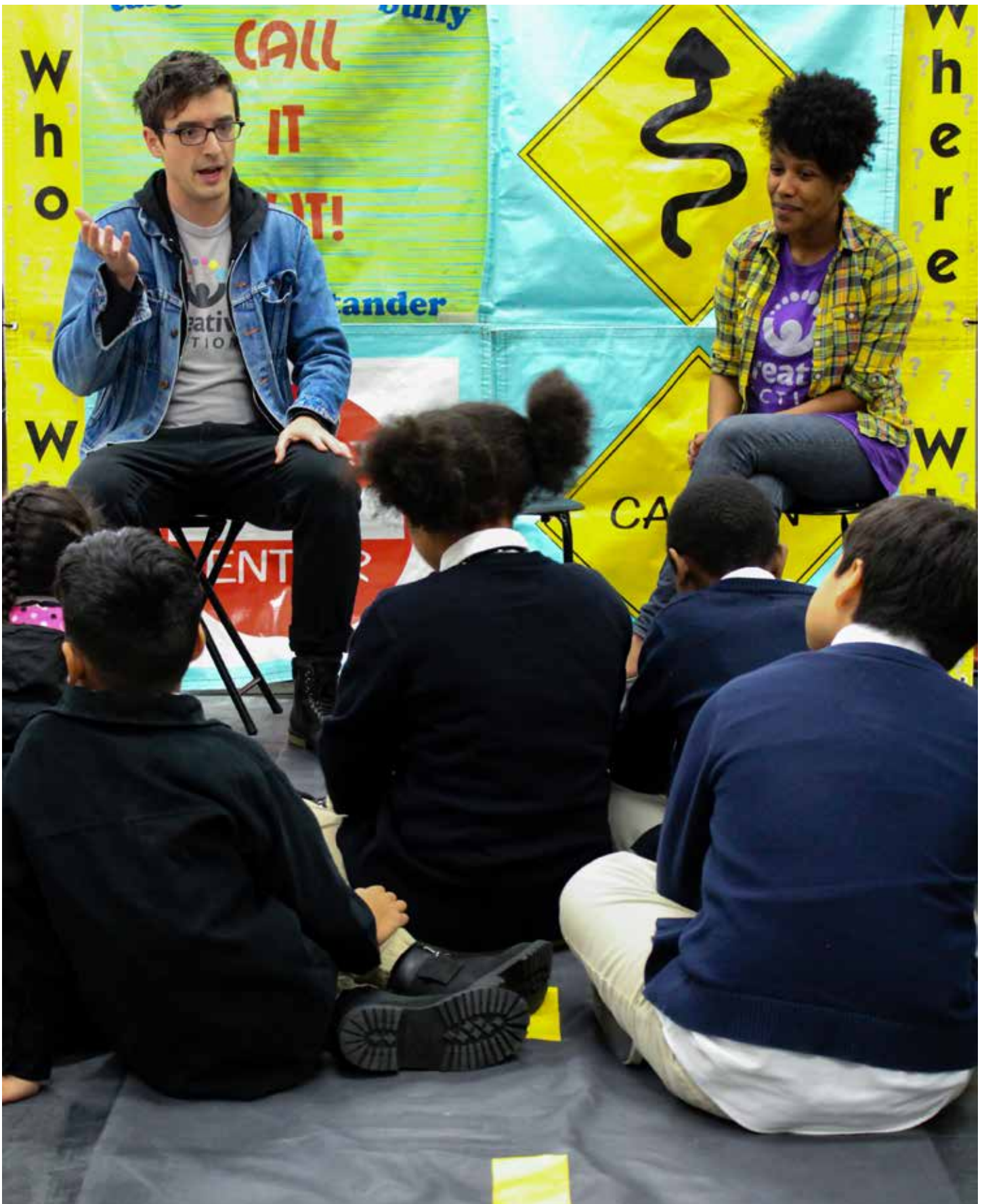
Creative Action Teaching Artists engage with 4th grade students using The Courage to Stand , a multi-day interactive performance that tackles bullying while developing students' social and emotional skills.